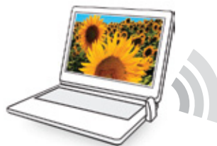
Wireless point-to-point connectivity of up to 30 feet / 10 meters between PC or laptop and DisplayLink™ enabled projector