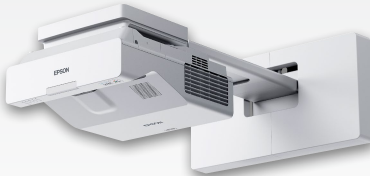
Product shown with mount, sold separately.