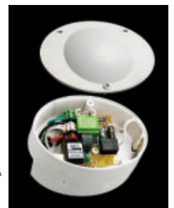
(Right) Built into the endcap, Draper's MCI enables IR, additional interface for dry contact closure and RS232. Programmable.