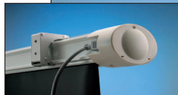
Back view of Salara case showing Plug & Play option. Patent pending.