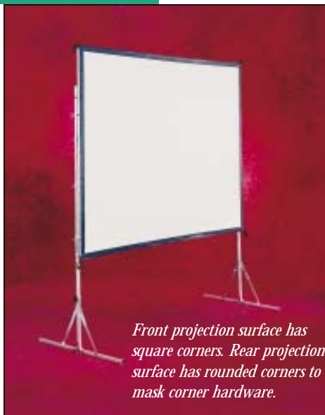
Front projection surface has square corners. Rear projection surface has rounded corners to mask corner hardware.

The Cinefold frame and legs are built of 1" square structural aluminum tubing. Steel hardware is cadmium plated. Frame and legs are conveniently color-coded and labeled for quick assembly. When assembled, the bottom of the frame is normally 44" above the floor and adjusts in 6" increments. Hinges are tempered steel and lock positively. Frame, legs, viewing surfaces and accessories are all standardized for easy replacements or additions to the system. Optional Dress Kits add a cinema-like effect.